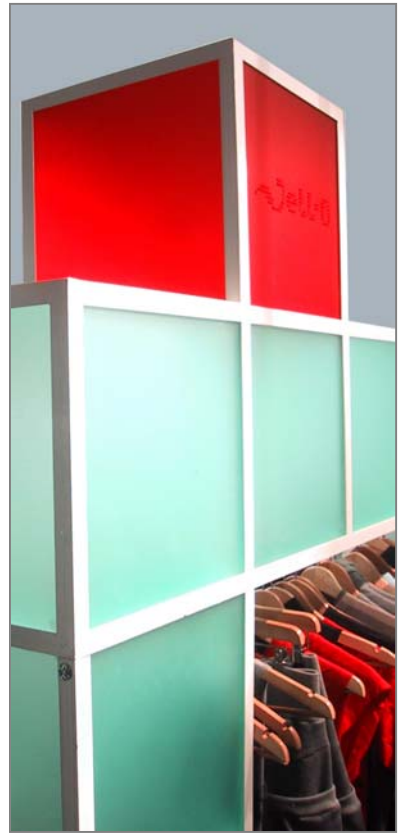
BoBo Design Ltd