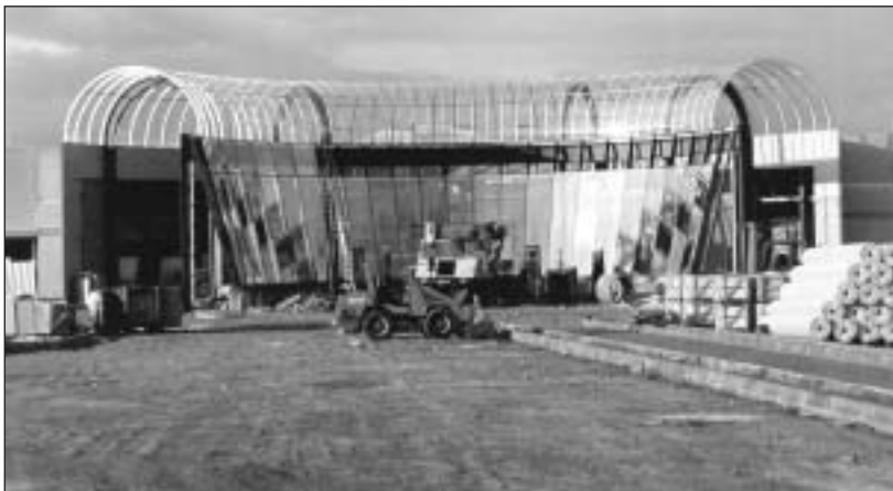
Shopping center glazing

Arla sheets are produced from resins that are certified according to UL 94. Furthermore, several products have been tested according to DIN 4102 (class B1 and B2), DIN 5510 (class S3, SR1 and SR 2, ST1 and ST2), BS 476 part 7 (class 1Y), NF P 92-501 (M2), CSE/75/A (class 1), CSE/RF/3/77 (class 1), UNE 23.727-90 (class M.4). A list of products that have been tested and their respective classification is presented on www.arlaplast.se . If information regarding classifications according to other standards is needed, it is often possible to retrieve information from our raw material suppliers. Please contact our technical support.