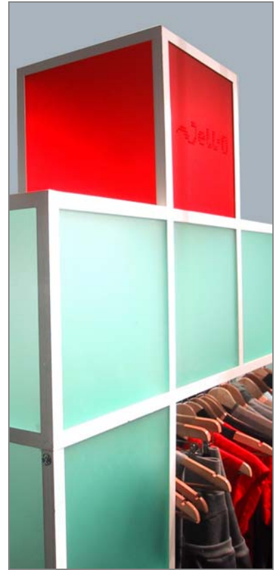
BoBo Design Ltd