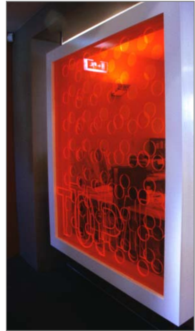
Vink Plast AS Design: www.intravision.no

Our latest innovation in the growing area of LED illumination is Perspex® 1TL2. A special opal acrylic sheet which offers high light transmission properties and excellent light diffusion characteristics. Ideal for use with LEDs, especially in slim illuminated signs where a slim profile and high light output is required.