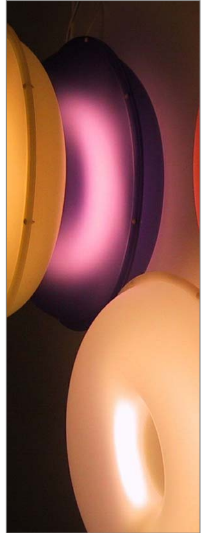
BoBo Design Ltd

Talk to us Tel: +44 (0) 1254 874000 info@lucitesolutions.com www.lucitesolutions.com